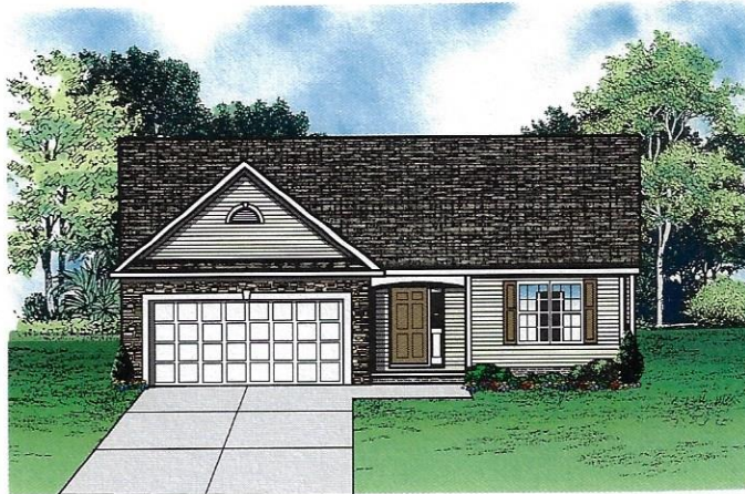
Optional Elevation 2