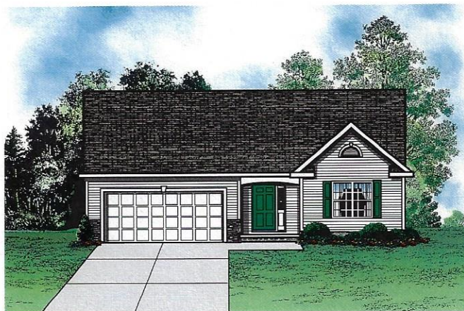
Optional Elevation 3

Some optional features may be shown or discussed. See ProBuilt sales associate for details and standard features. Floor plans subject to change. This rendering and floor plan are for illustrative purposes only and are not intended to be part of any purchase agreement or construction contract. In the interest of continued product improvement and the challenge of material availability, builder reserves the right to modify plans, specifications and standard features without notice. This home plan is the exclusive copyright of ProBuilt Homes or the plan designer. All rights reserved. Reproduction of this plan, either in whole or in part, including any form of copying or derivative works therefrom, is strictly prohibited.