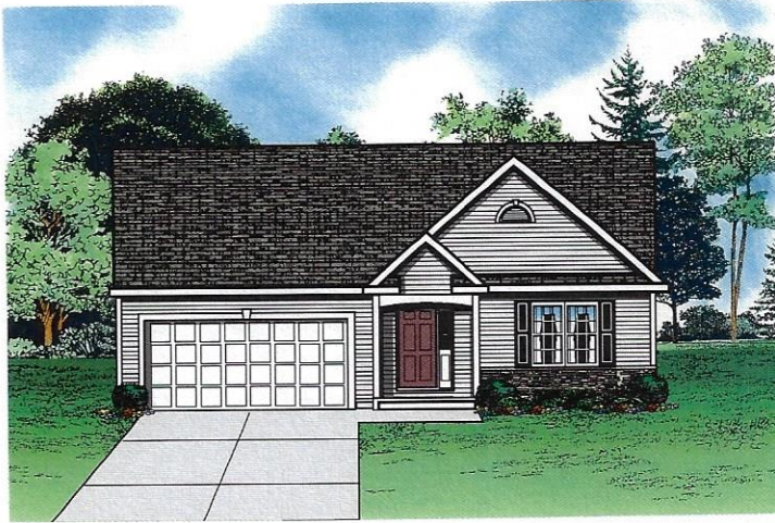
Optional Elevation 1